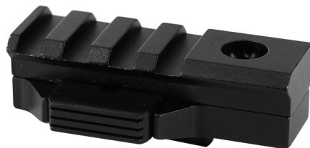
4. Locking M-lok Quick Detatch 60mm Picatinny Rail with QD Socket