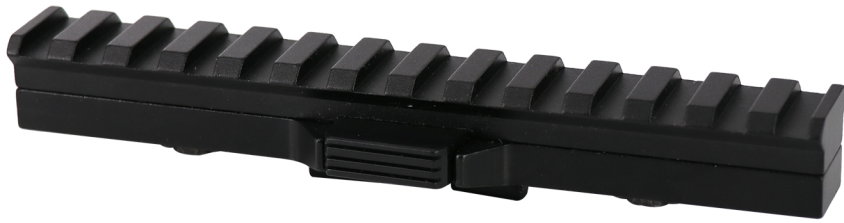
1. Locking M-lok Quick Detatch 140mm Picatinny Rail