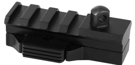
5. Locking M-lok Quick Detatch 60mm Picatinny Rail with Bipod Adapter