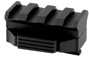
2. Locking M-lok Quick Detatch 40mm Picatinny Rail