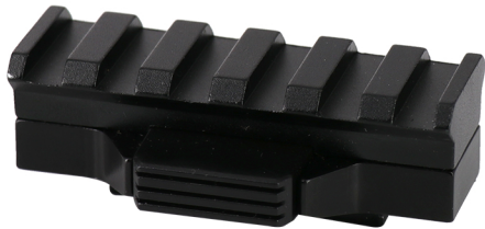
3. Locking M-lok Quick Detatch 60mm Picatinny Rail